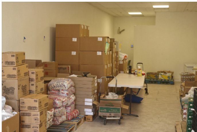
The New Space

In order for the congregation to move back into the South Bay worship space and social hall, the pantry needed to rent dedicated space for themselves. Luckily, a suite opened up in the same strip mall where the congregation meets. After the pantry signed a lease for two years, Valerie Jaques devoted many hours to addressing requirements for opening such as installation of a hot water heater and organizing volunteers to perform other upgrades to Suite 105.