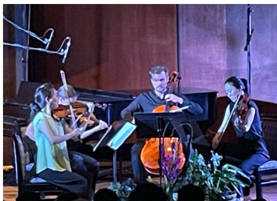
La Jolla SummerFest Community Concert

The OGF Committee administers the gift allocation from the Renewal and Growth Fund to bring in speakers, music, groups, and events to our campuses, and to promote greater ethnic, racial, class diversity among members and attendees. The person(s) responsible for producing and promoting the events, need to have the skills and abilities to know what is current and timeless, to find suitable speakers and groups, and to promote and budget."