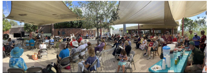
Audience enjoying the Hootenanny on the Hillcrest Patio

The intent of the Outreach and Growth Fund is to make First UU a more happening place with the expectation that these events over time will result in more Sunday visitors, church members, pledges, and donations.