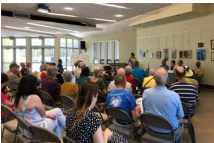
SJ Sunday Climate Forum in September 2019