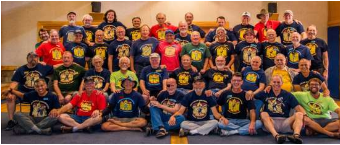
UUMF Fall Renewal 2019 at Camp Stevens, Julian

UUMF is an active and vital organization of men in our church, both members and friends, who participate in our many activities and who are committed and aspire to do men's work. New men and all men friends and members of the church are always welcome. A Steering Committee is the organizing body of the group.