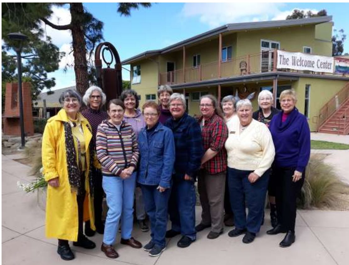
The Book Room Crew