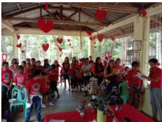
Valentine's Day Love Service at our Partner Church

did before. In addition to raising the funds to fulfill the requests for scholarship assistance for elementary and High School students, we were also able to support the new Ministerial Formation Training that is being provided to the ministers of the many congregations that are part of the Unitarian Universalist Church of the Philippines. Because of our increased ability to communicate with individuals in Malingin and Dumaguete we have been able to keep our congregation appraised of how the world-wide Covid pandemic has impacted this small community. We have begun this year to meet on a monthly basis and when the shelter-in-place rules went into effect, we began meeting electronically.