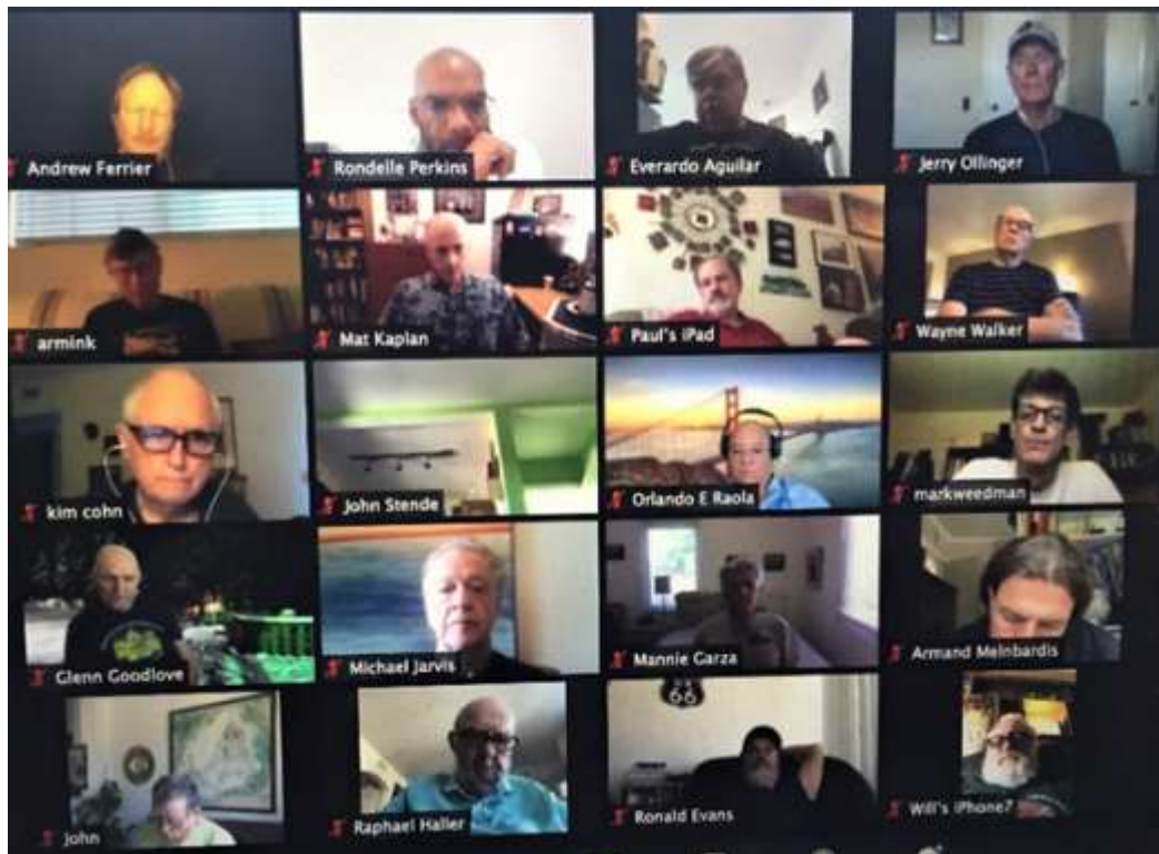
UUMF Spring Renewal 2020 on Zoom