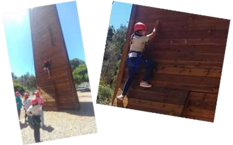
2019 Coming of Age youth on the challenge course

Goal 3. Raise our individual and collective awareness in order to identify and remove cultural, physical, and attitudinal barriers to full participation in our congregation.