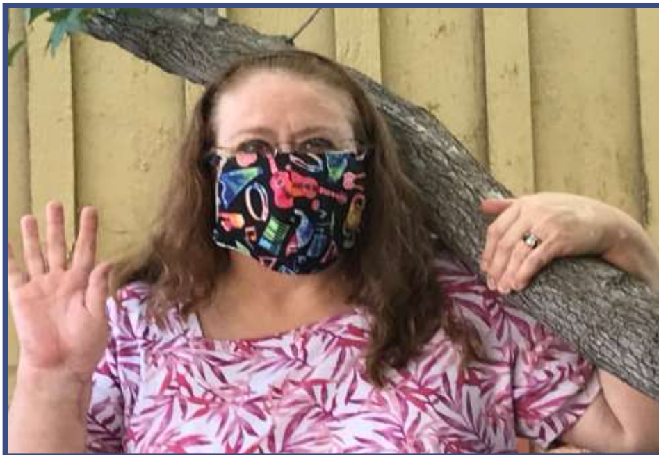
Robie showing off a hip new 2020 fashion trend!