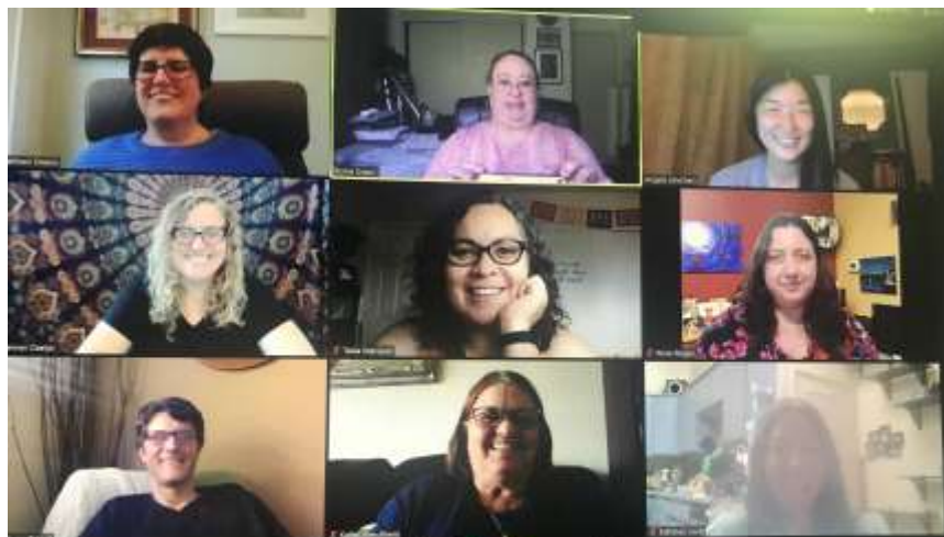
The weekly Staff Meeting held via Zoom