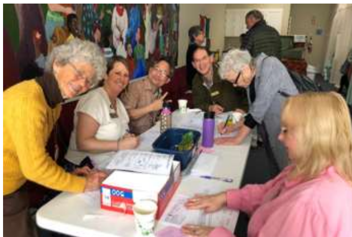
Letters to Voters Party at South Bay