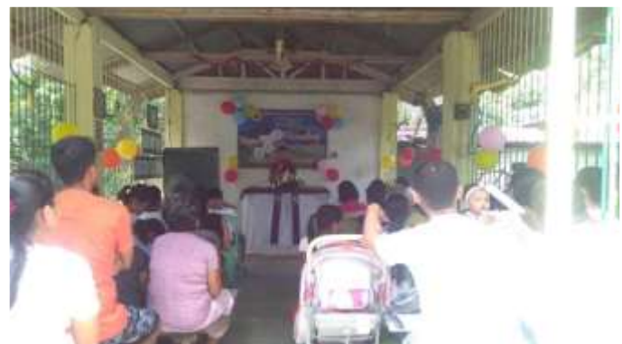
Celebration of the 39th Anniversary of the Malingin Congregation in October 2019

In the coming Church year we plan to continue to support the children and youth of our partner congregation through funding scholarships. We hope to further develop our relationship with this community through our increased communication and find further ways that we can be partners with each other.