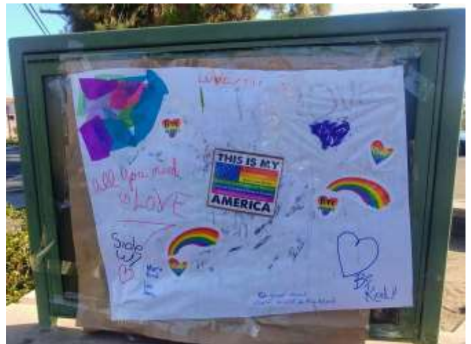
Youth respond to an act of hate with an outpouring of love and lots of glitter!