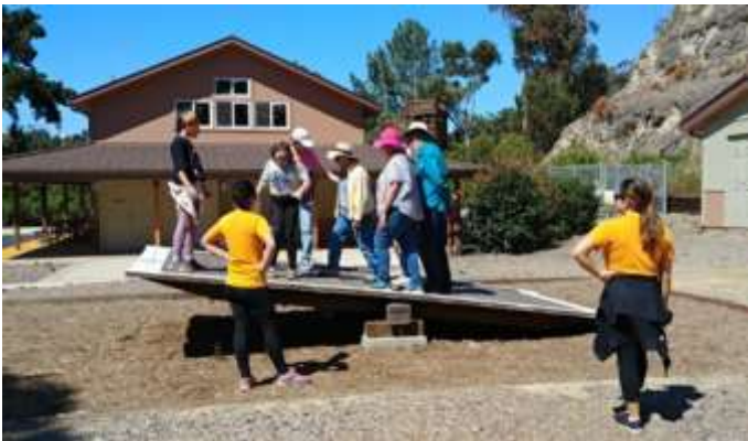
2019 Coming of Age youth and mentors

Goal 4. Intentionally engage all generations in leadership development.