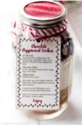
Youth participated in the annual Crafts Fair by creating cookie mixes in jars