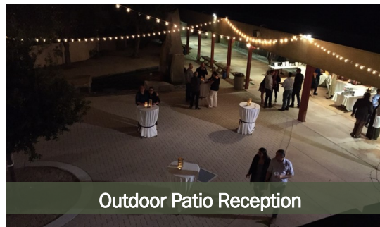
Outdoor Patio Reception

100% accessible for wheelchairs and walkers, our Patio holds up to 200 people and features a James Hubbell designed fountain & a Rhonda Lopez hand-sculpted stoneware memorial wall. The Patio is an open, uncovered outdoor space with natural landscaping, new brickwork and ambient night lighting.