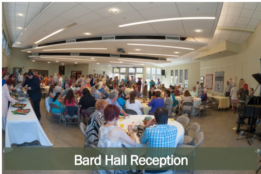
Bard Hall Reception

Add-On for General Public, $950 Stand-Alone for General Public, $1,400