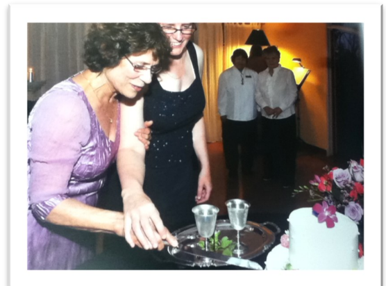
Common Room Reception

Add-On for General Public, $500 Stand-Alone for General Public, $800