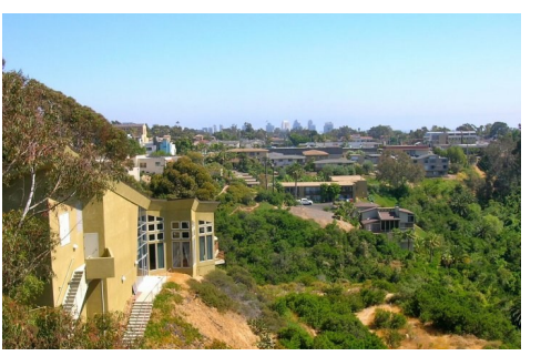
Clark Chapel viewed from across the canyon.